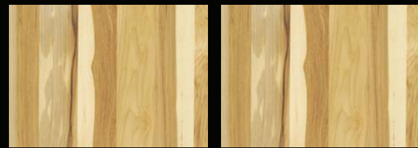
First Second & Better