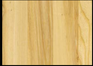
Select & Better