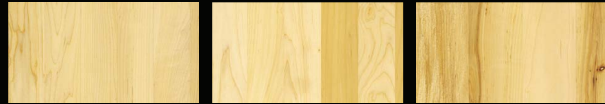
First Second & Better Third