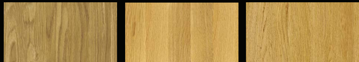
Clear Select Quartered Select & Better